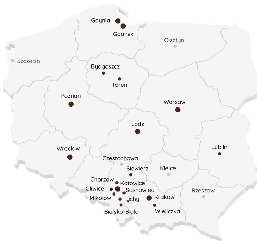
Map of Murapol Group developments (as of 31 December 2025)

The financing structure for residential purchases at the Murapol Group is closely dependent on interest rates and the buyer's creditworthiness. During periods of high borrowing costs, as was the case in 2022 and 2024, we observed a clear predomi-