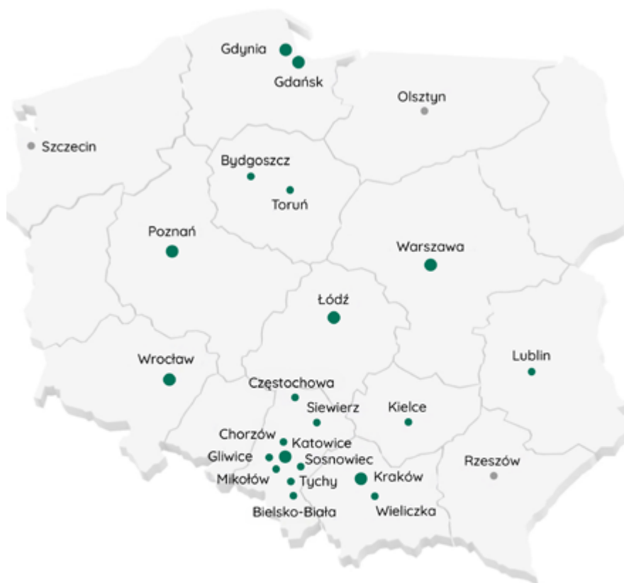
Map of Murapol Group developments (as of 31 December 2024)

Thanks to its geographic diversification, the Murapol Group reaches a wide range of customers and can benefit from the growth of not only the largest, but also local residential markets.